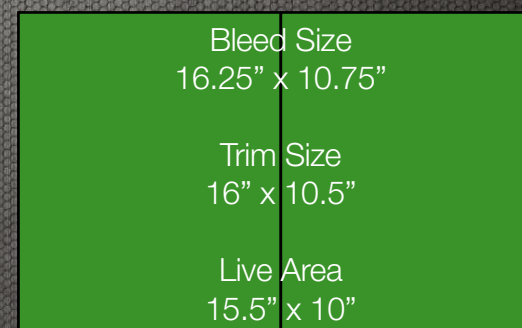
2 Page Spread