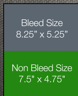
1/2 Page Vertical