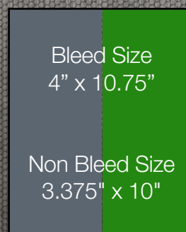
1/2 Page Horizontal