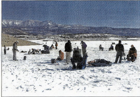
A gang of ice fishermen congregates at Crawford Reservoir south of Hotchkiss. Unlike warm-weather fishing, many ice anglers find spots to catch fish close together. Most ice fishermen are walkers, carrying a bucket or pulling a sled with their gear.

So how do you decide where to plug your gear? Ice fishing is funny in that