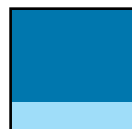
3/4 Horizontal (10w x 8h)