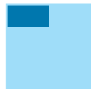
1/8 Horizontal (5w x 2.6h)