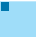
Credit Card (2.4w x 2.6h)