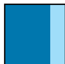
3/4 Vertical (7.5w x 10.7h)