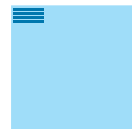
Line Class. (varies)