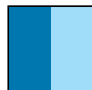
1/2 Vertical (5w x 10.7h)