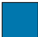
Full Page (10w x 10.7h)