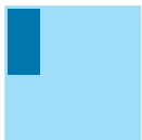
1/8 Vertical (2.4w x 5.3h)